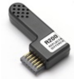
R200 - Replaceable Temperature/Humidity Sensor Angled Temperature/Humidity Replaceable Sensor