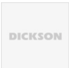
N530 - Wireless Wizard2 IQOQ Validation Package Wireless Wizard2 IQOQ Validation Package