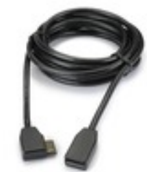
A895 - Probe Extension Cable 10' Extension Probe for Pre-Calibrated Sensor